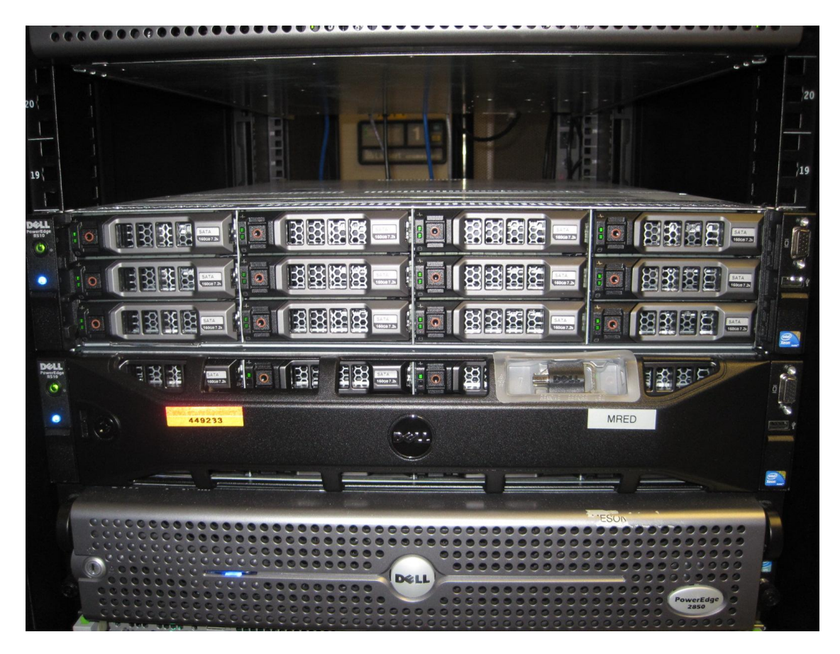
Figure 1: The Dell Intel Xeon 5520 server